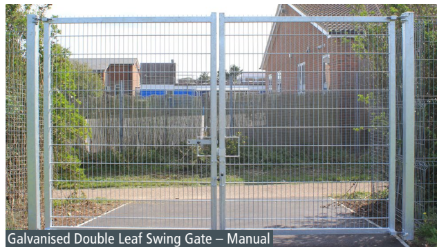
Galvanised Double Leaf Swing Gate – Manual

Jacksons' EuroGuard® gates are designed to match our range of EuroGuard® fencing. Available in Flatform Heavy, Extra, and Combi, they create secure access points with your choice of aesthetic, on their own or used in conjunction with the matching fencing to create a uniform perimeter. All steel and timber gates are supplied with a 25 year guarantee against rust, rot, insect attack, and manufacturing defects.