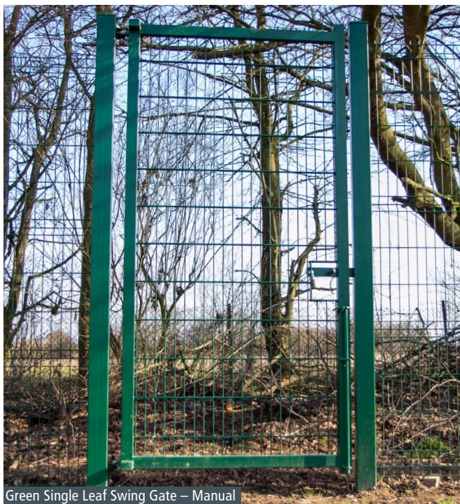
Green Single Leaf Swing Gate – Manual